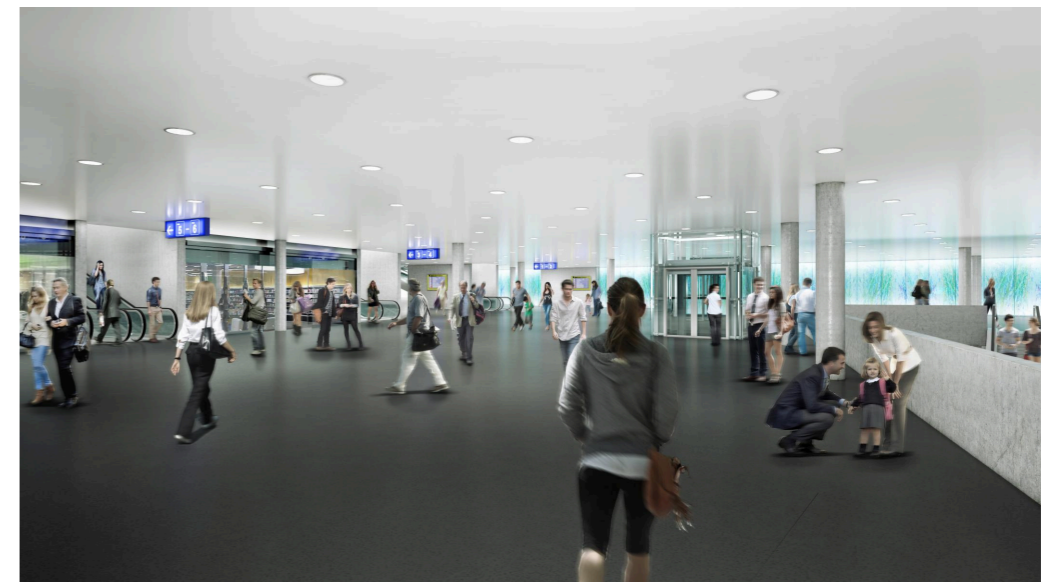
Version: 28 February 2022